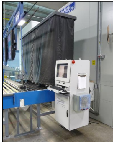
Osprey® stands over output conveyor