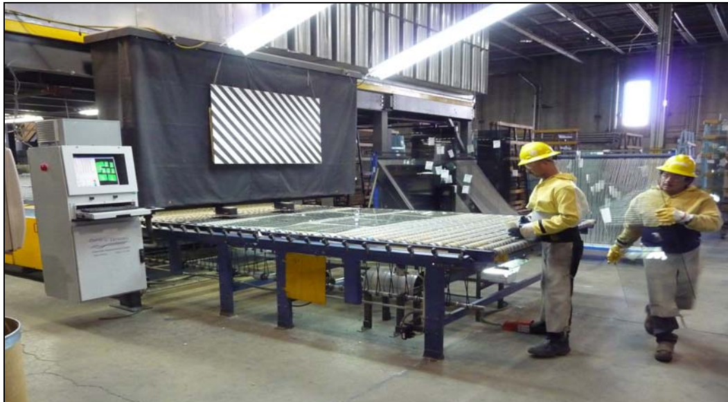
Osprey ® stands over output conveyor