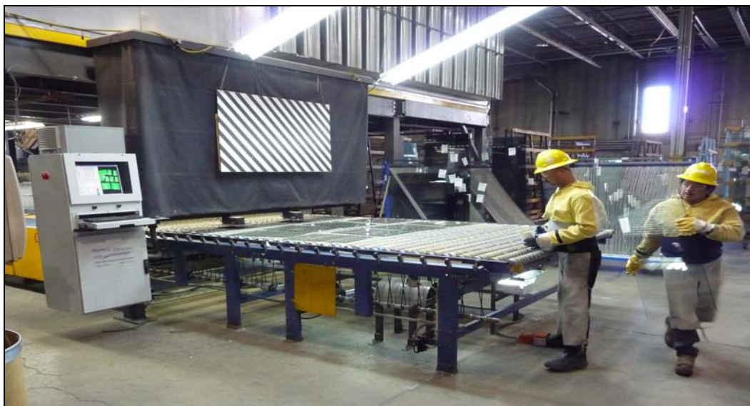
Osprey® stands over output conveyor